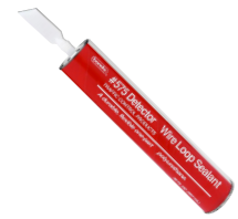
#575 ONE QUART CARTRIDGE—Gray