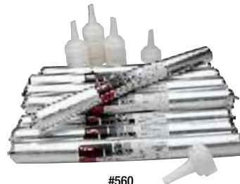
#560 ONE LITER SAUSAGE PACK—Black

Bondo One-Part Polyurethane Loop Sealants provide excellent protection for traffic detector wires under the most extreme physical, chemical or mechanical exposures. This non-shrinking, non-hazardous sealing system was designed to cure in the presence of moisture and is suitable for use on concrete and asphalt. It is also self-leveling which ensures full encapsulation of the traffic detector wires.