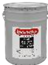
#6063 4.5 GALLON PAIL