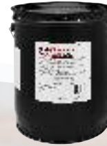
#578 4.5 GALLON PAIL—Black