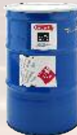
#9606 50 GALLON DRUM