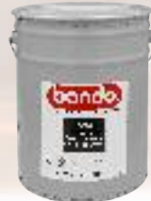
#6065 4.5 GALLON PAIL